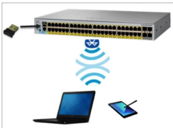
Figure 2. Over-the-air switch access using Bluetooth